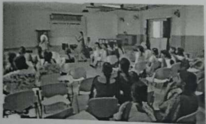
Students actively participating in Mono Acting Competition